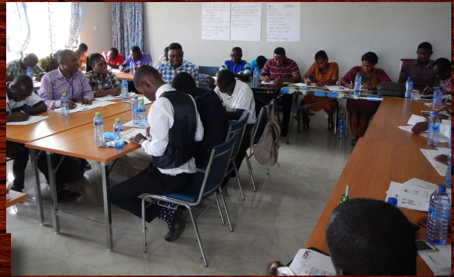
Train the Trainer Conference, Ghana

This incredible growth is a direct result of the number of new Program Leaders trained through our Train the Trainer conferences held in Tanzania and in Ghana, in partnership with Global Connection International.