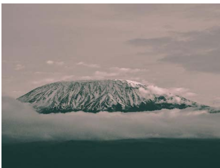
Mt. Kilimanjaro, Tanzania

Please, please keep the Tanzania program in your mind. And, please, keep praying for us day to day. We love you!