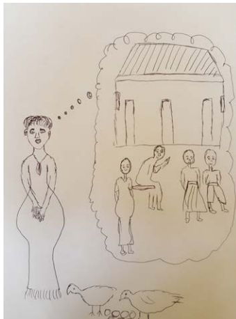
Program participant's "Big Hope"

seriously to choose good partners and good members to involve in our programs.