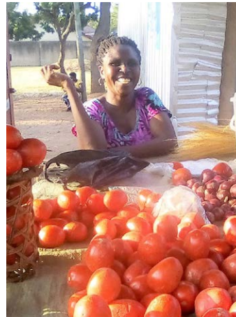
Entrepreneur at work

work with Get HOPE Global. As a global leader, leading the Mwanza, Tanzania program, I currently have 5 teams with 75 women who have received their loan money after successful training in our business training classes. They are currently working, but also get time every week for leadership training. So far, the program has touched 90