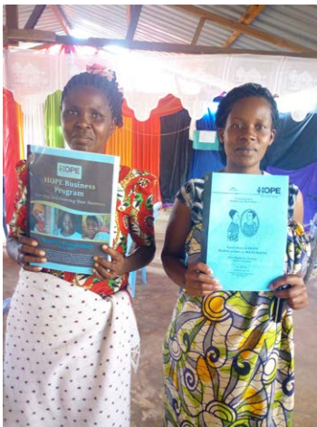
HOPE materials translated into Swahili

"I realize three problems: human trafficking, poverty; and spiritual downfall. Thank God we have a means through Get HOPE Global that transforms the poverty mindset..."