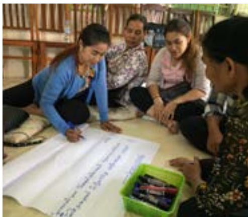
Group work during business training