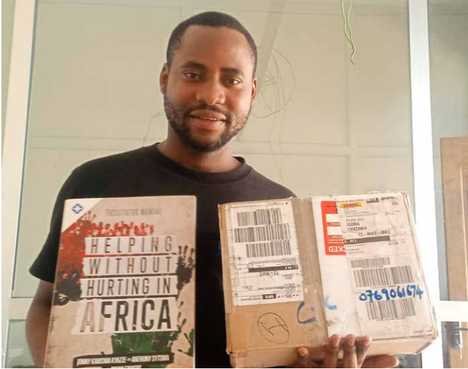
Receiving “Helping Without Hurting” in the mail

I have been able to use the book for mentoring sessions with local pastors. Even though these pastors may be driven by the Holy Spirit, they may lack managerial or leadership skills, hence affecting the church growth in Tanzania and Africa as a whole. If local pastors and community leaders can be equipped with some program management and leadership skills, then the gap will be bridged. I still see the need for capacity building training for the local pastors in the areas of women empowerment in particular.