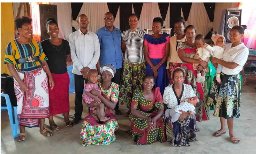
Leaders of HOPE training groups with local pastors