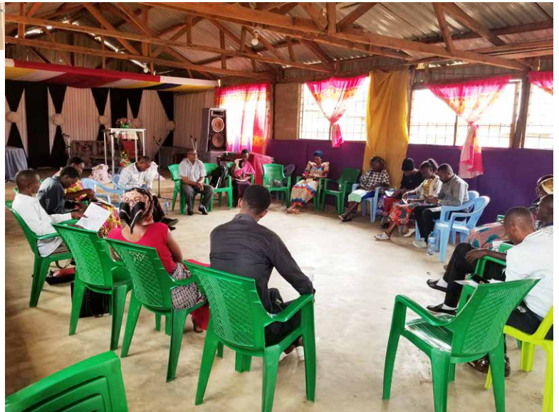
Community leadership meeting in progress

It was a great thing for me to receive the book, Helping Without Hurting in Africa , sent directly from the HOPE team in the USA in 2021. After reading it, I saw how learning and taking action myself has great worth to my personal development. This concept of doing for ourselves has been missing in my community. This is what motivated me to start sharing the book with others. Regardless of their roles in community development activities, both local government and religious leaders lack some skills to help them play their roles well. It is with due respect that I pay attention and set time to help meet and train them.